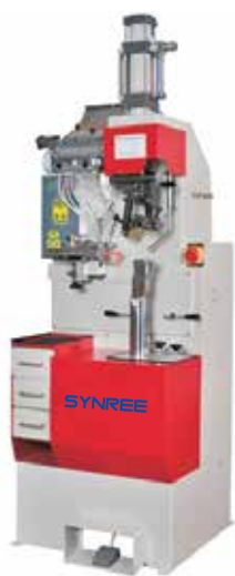
SR-682 全自動釘跟機 Automatic Heel Nailing Machine