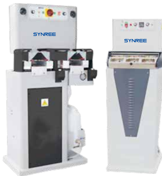
SR-58 後跟蒸濕機 Back steamer