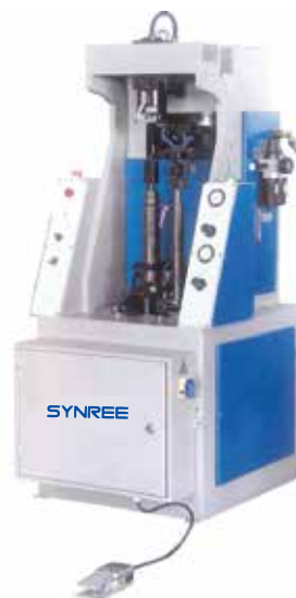
SR-266 後根按摩機 Heel Breasting