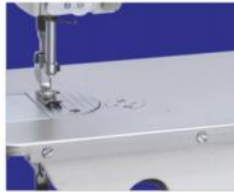
不銹鋼面板 Stainless Steel Plate