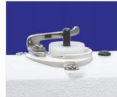
繞綫機構 Winding structure