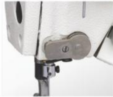
電子夾綫器裝置 Electronic thread tension controller