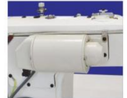
自動抬壓腳裝置 Automatic presser foot lifter device