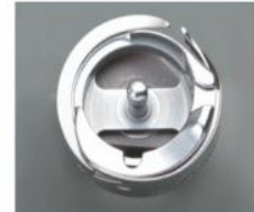
進口旋梭 Imported hook