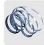
EVA切割刀带 EVA cutting blade