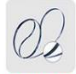
EVA斜剖刀带 EVA sloping blad